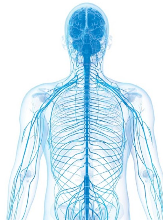
Figure 1. The Central Nervous System

In MS, the immune system mistakenly attacks and destroys myelin. This is called demyelination (see Figure 2). The body can heal some of this damage. But sometimes it can't keep up. Instead, plaques, or lesions, form on the nerves. These can slow or stop messages from moving between the brain and body. This causes MS symptoms. These can include fatigue, vision problems or trouble moving body parts. 1